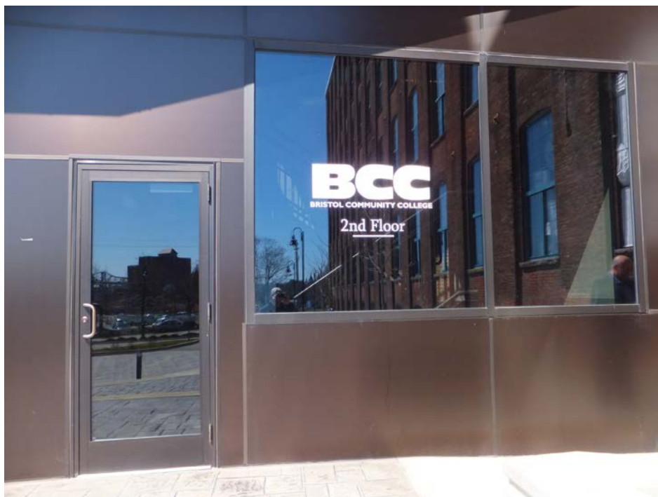
The back entrance of the WEI building.