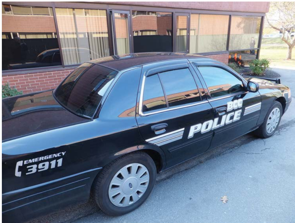
Campus Police Car

Bristol Community College is making a wise decision in arming their campus police. It's important to have a secure school and all students should feel safe at all times.