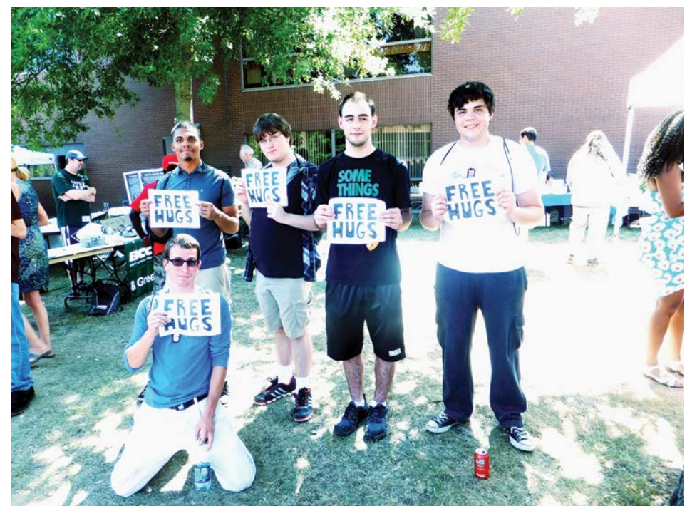
Kick-off to College Celebration