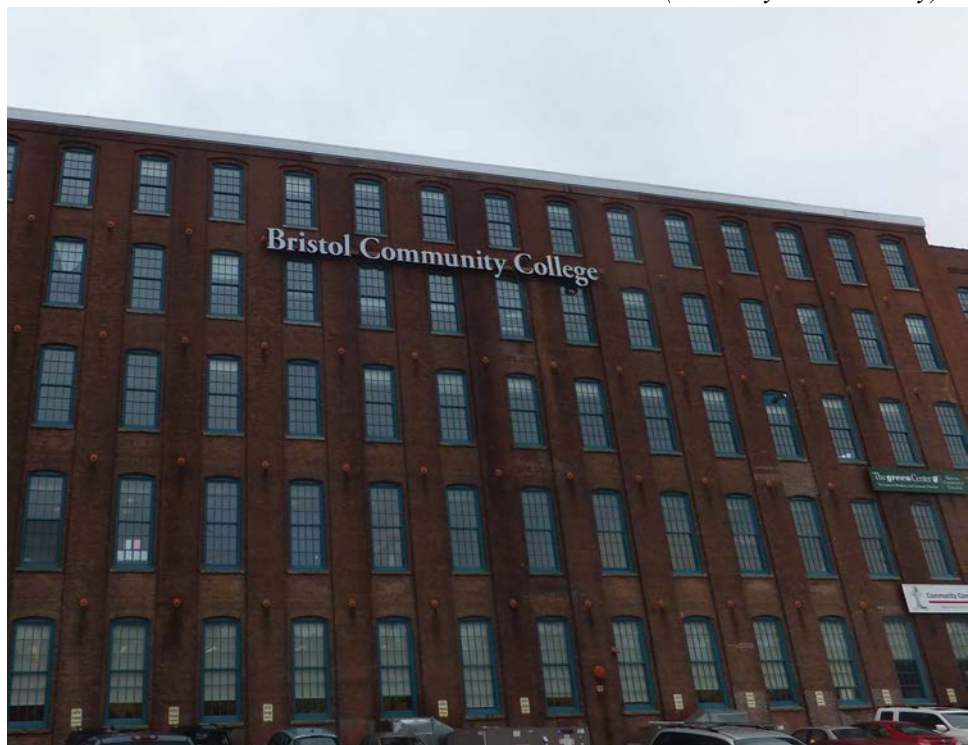
The WEI Building on Davol Street in Fall River