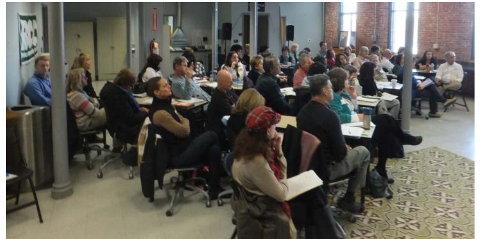
A WEI Classroom