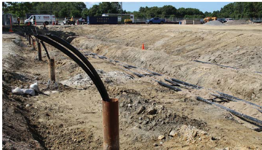
Thirty wells like this one, each extend 500 feet below ground, will supply the Sbrega building with geothermal energy.

The recent construction projects are a continuation of sustainability efforts; in 2008, a 10-kilowatt solar system went onto the Engineering Building (B). In 2010, an 86-kilowatt system was installed onto buildings C, D, and F.